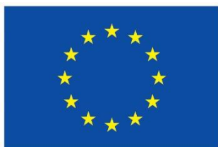
EU emblem in full colour

For the correct use of the EU Emblem, users are to make reference to Annex II of the Commission Implementing Regulation (EU) No. 821/2014.